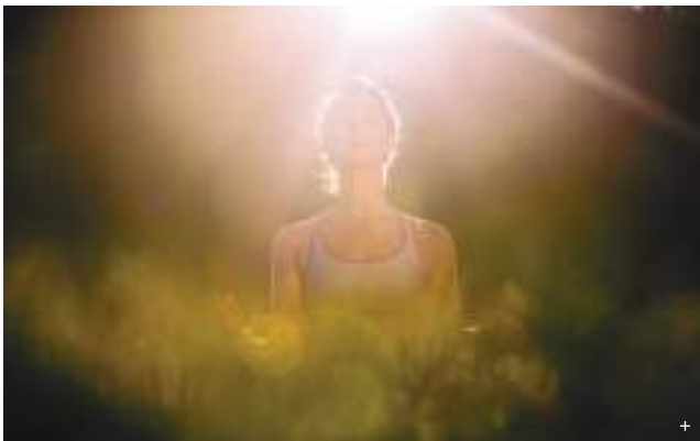
+ Stock Images used for representation purpose only