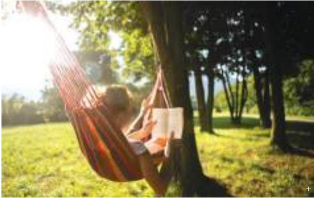
Stock Images used for representation purpose only