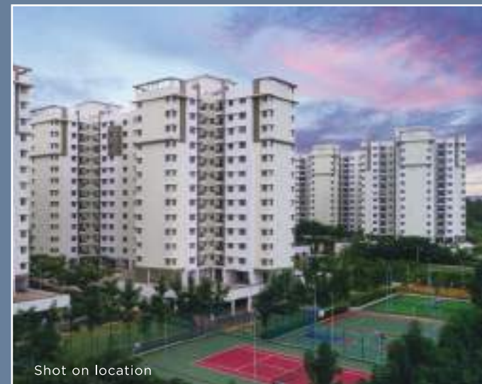
Shot on location